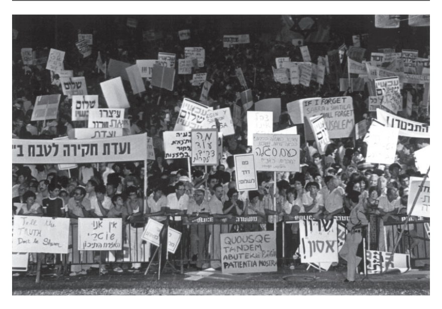
Demonstrators holding placards demanding the establishment of an official commission of inquiry into the massacre at Sabra and Shatila refugee camps in Beirut. (In Tel-Aviv, September 25<sup>th</sup>, 1982.)

became a serious option; consequently, the 1982 Israeli invasion of Lebanon was "born of the ambition of one willful, reckless man."