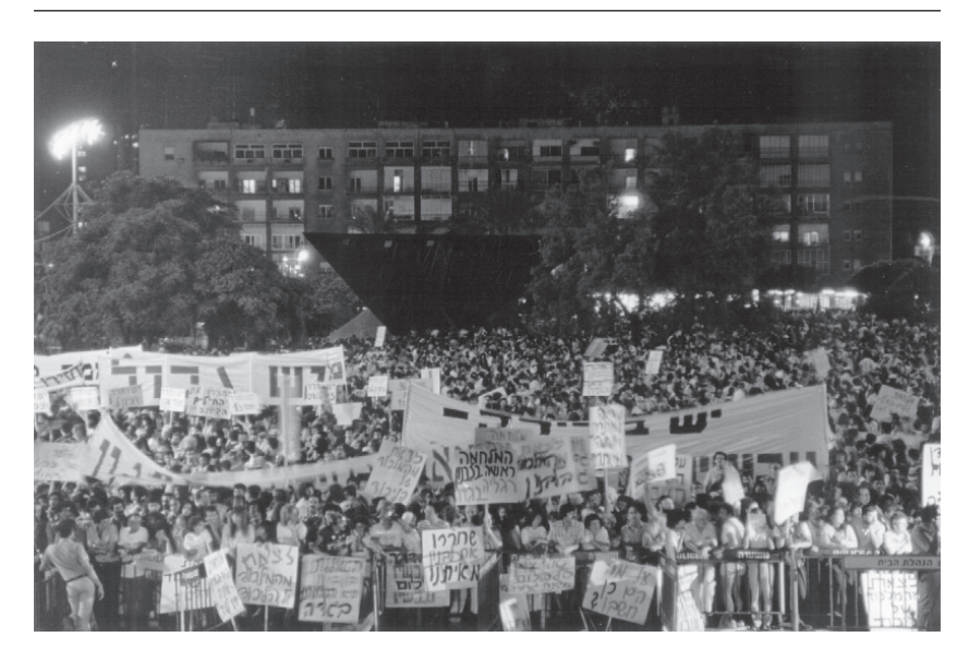
About 150,000 Peace Now protesters demonstrating for an immediate pullout from Lebanon and the resignation of the Government at a mass rally in Tel-Aviv, June 1987.

subverted the fundamental purpose of the group meetings. Rather than producing a broad forum to explore all avenues, the group quickly moved toward reinforcing the favored plan. Indeed, the more amiability that developed, the greater the danger that independent views were replaced by groupthink. This, in turn, was likely to result in irrational and dehumanizing action directed against out-groups. The Sabra and Shatilla massacres, undoubtedly, fall into this category.